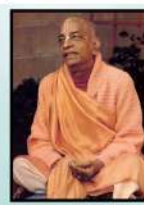
H D G A.C. Bhaktivedanta Swami Prabhupada

LEGEND- BOULEVARD 1 - Main Entry 2 - Information Centre 3 - Mathura Lake front 4 - Krishna Prasadam 5 - Sudharma Assembly Hall