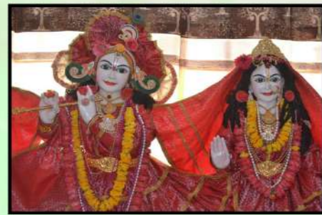
Sri Sri Radhika- Madhava ji